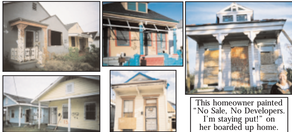
This homeowner painted "No Sale, No Developers. I'm staying put!" on her boarded up home.

Still Unable to Return Home --250,000 renters and homeowners, mostly African Americans. By Feb 2007 only 632 of the 77,000 home owners eligible for federal Road Home rebuilding funds have received them. Renters receive no funds (64% of N.O. residents rented). Rents have doubled in the "hood" from $450 to $850 for a 2 bedroom